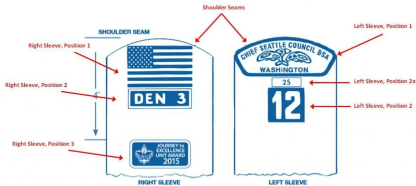
Image courtesy of Boy Scouts of America. Diagram created by Cub Scout Ideas.

Cub Scout uniforms seem to have lots of patches! Kids love earning and displaying their rank advancement and showing off what activities they have done. Patches can be sewn on, either by you or by the Scout Shop, or can be glued on using Badge Magic ( https://scoutingmagazine.org/2015/08/sponsored-spend-less-time-sewing-and-more-time-scouting/ ) Just be aware that Badge Magic can leave behind a residue if you remove / re-use the uniform with another Scout.